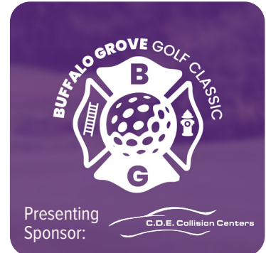
The Arboretum Club August 6, 2025 Partnering with the Rotary Club of Buffalo Grove