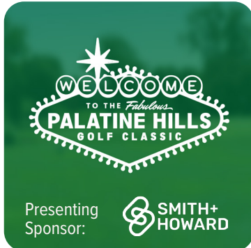
Palatine Hills Golf Course June 5, 2025

We exist to support children and adults with disabilities through philanthropy for Northwest Special Recreation Association