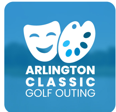
Arlington Lakes Golf Course September 11, 2025 Partnering with the Rotary Club of Arlington Heights