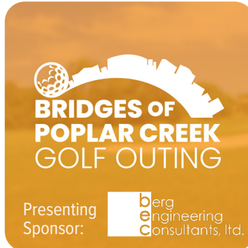
Bridges of Poplar Creek Country Club June 25, 2025 Partnering with the Rotary Club of Schaumburg/Hoffman Estates