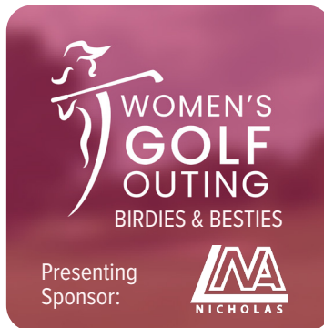
Mt. Prospect Golf Club August 27, 2025